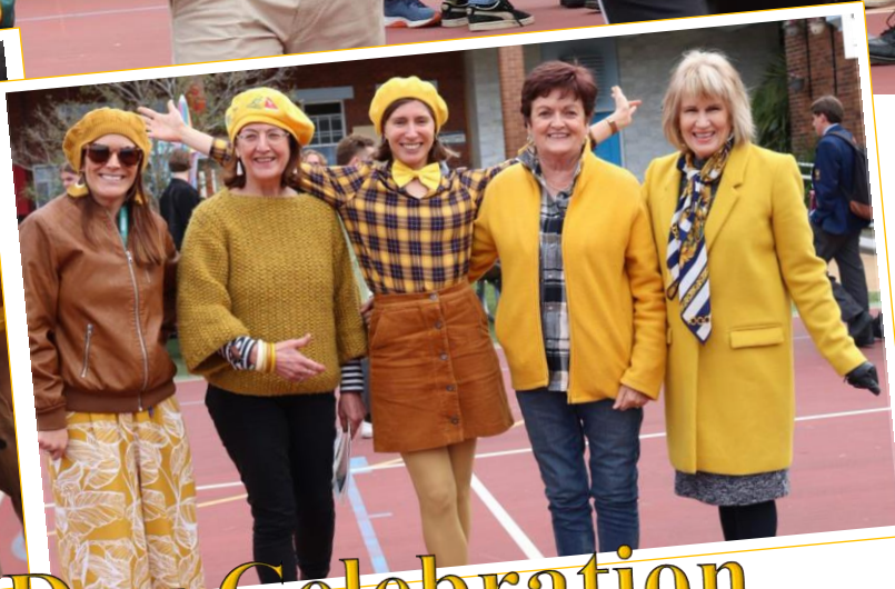
MacKillop Day Celebration