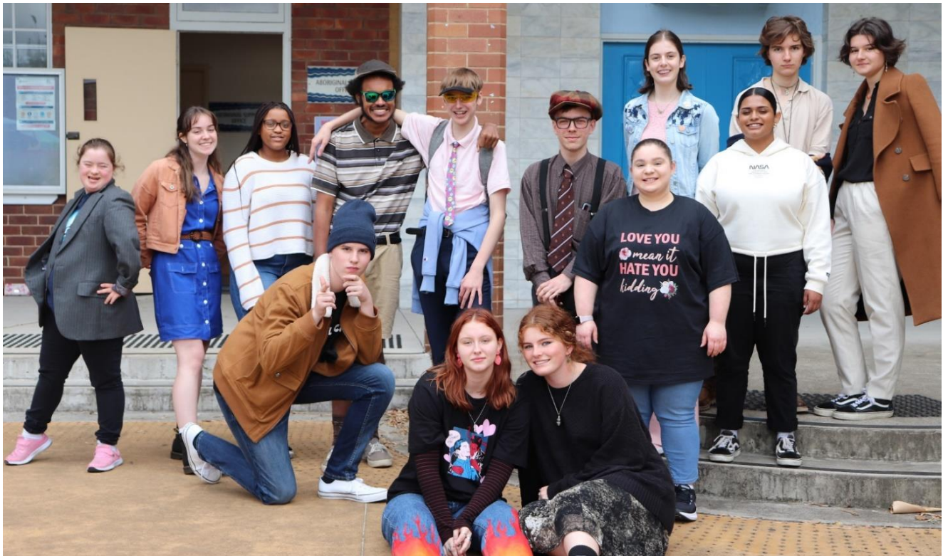
Some fashion parade participants – Vinnies Day – May, 2021